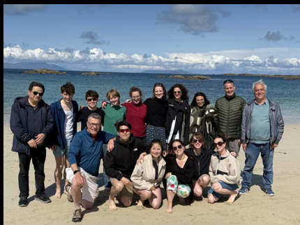
Our musicians at Music Coll in 2025