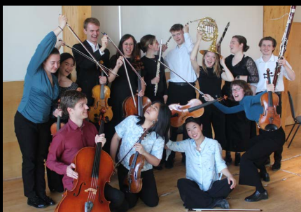
Our musicians at Music Coll 2024