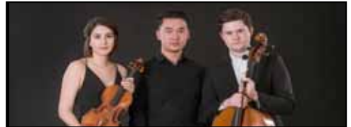
London Panufnik Trio