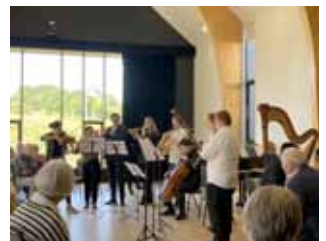
Music Coll 2019 Finale - 'Carnival of the Animals' All musicians join together for a performance of Saint-Saëns' fun work