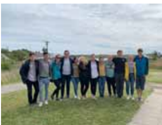
A close-knit group in 2019!

Music Coll 2019 was made possible through generous donations from the Misses Barrie Trust, the Albert & Eugenie Frost Musical Trust, Marigold Whittome Memorial Trust and the Murdoch Forest Charitable Trust. We were also delighted to receive generous 'in kind' sponsorship from Caledonian Macbrayne ferries.