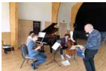
The Louko Trio in a coaching session

or at our website: www.tunnelltrust.org.uk/howeare.html