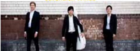
Louko Piano Trio