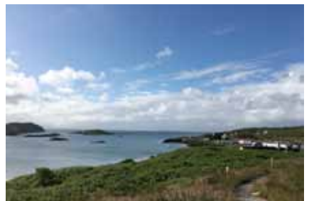
Another perfect Coll day!