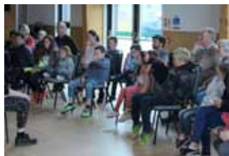
A packed out workshop with the local Coll schoolchildren hosted by Cavendish Winds and the Attard Zerafa Duo